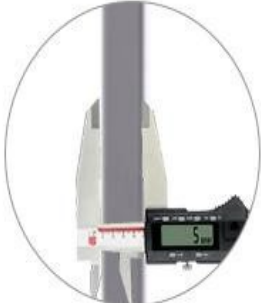
Only 5cm thick metal structure