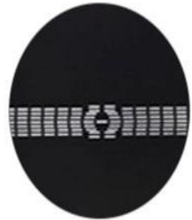
Dense cooling holes fast heat dissipation