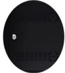
Secure and anti-thief various protection